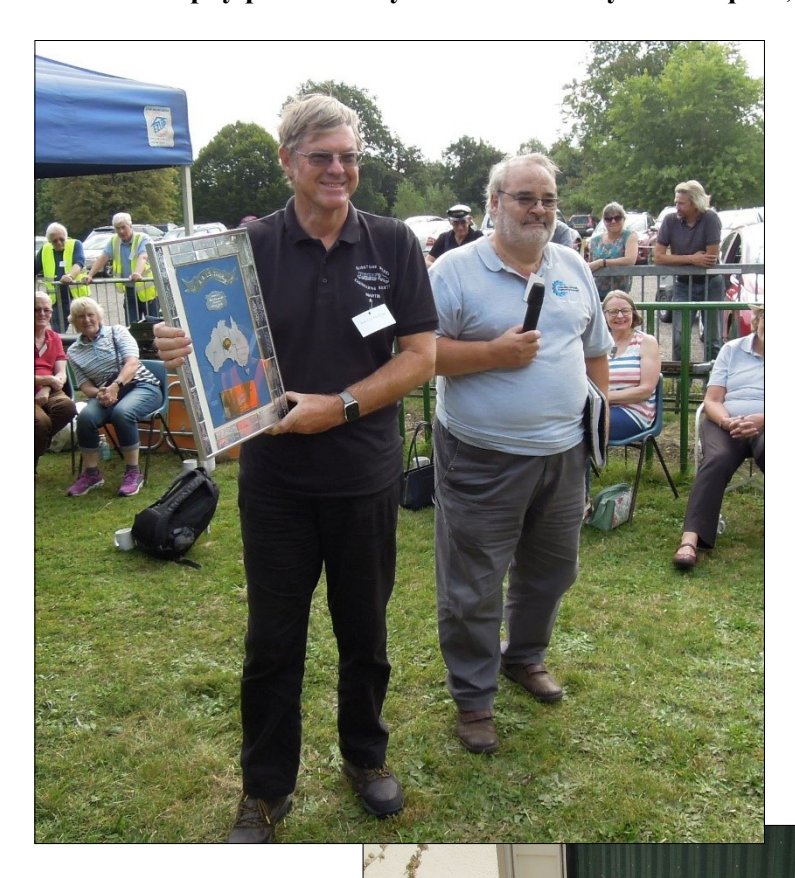
.... and then from RSME members tea and cake for everyone....