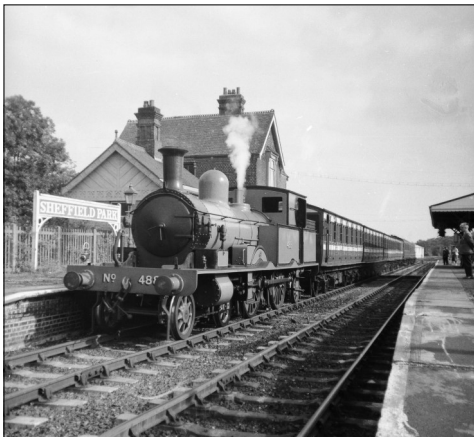
Adams Radial Tank No 488 at Sheffield Park with the Metropolitan Chesham Set. 29 August 1962.

Three days? As originally planned, but the move of a holiday day messed up distant planning. Let's look forward to Giants of Steam in the Autumn. We got as far as Bracknell and succumbed to a KFC, the services on the M25 were heaving.