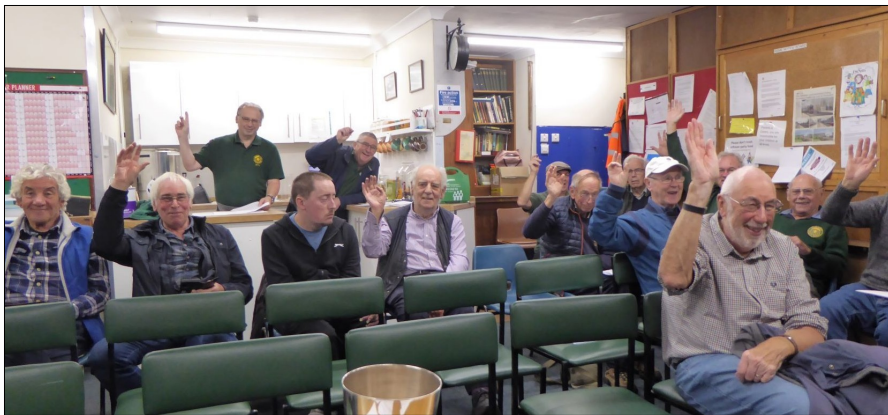
All In Favour.