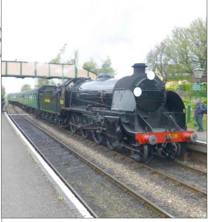
L S W R S15 class 4-6-0 No 506 makes a noisy entrance into Ropley station on 26 April 2024.

TRUSTEE NEWS LES IS REUNITED A BIG WASHER? PROSPECTUS AND THE FUTURE PHOTO NEWS DIARY